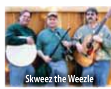
Skweez the Weezy